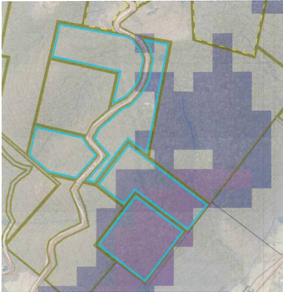
Huon Valley Zoning Association's Viewshed Map: