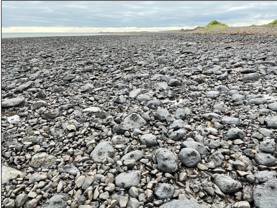
Extensive cobbly zones between sandy beaches on the western flank of the Stanley Peninsula.