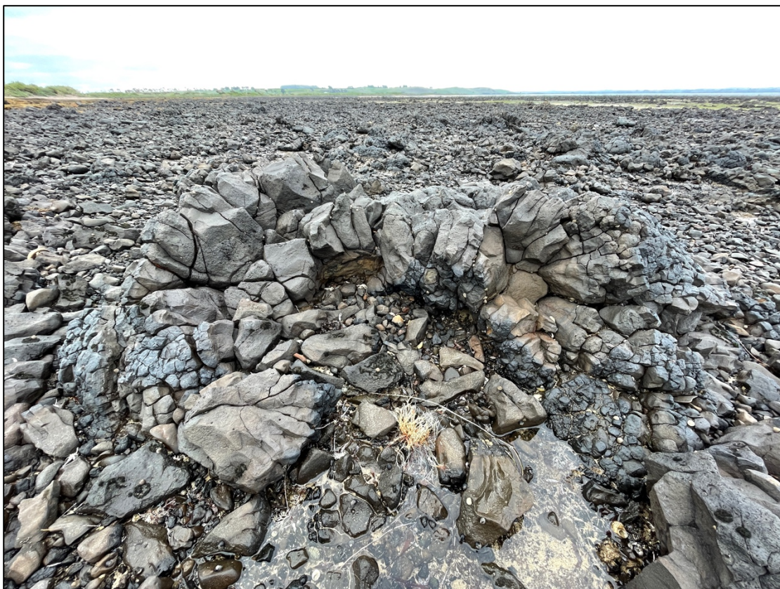
Pillow lava outcrop within cobbly zone showing classic features (along traverse WT).