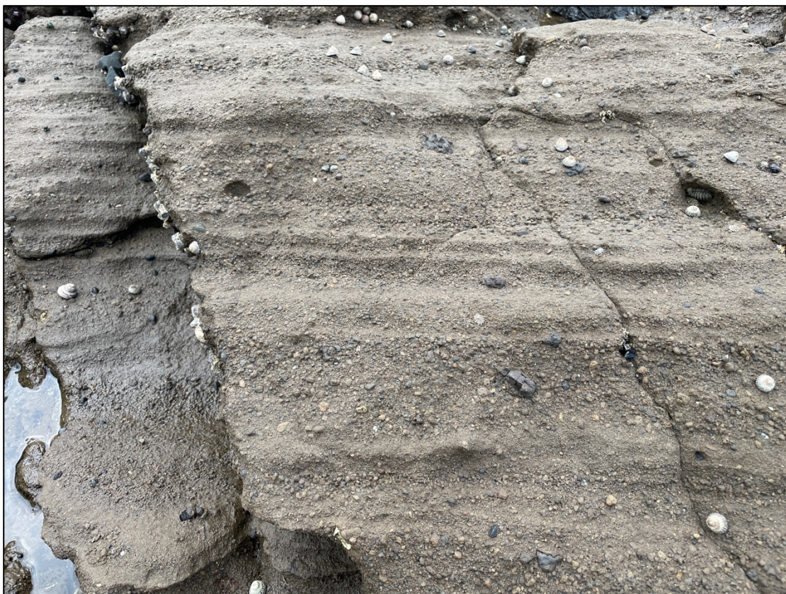
Ash beds of volcanogenic sediment sequence showing stratification from multiple eruption events.