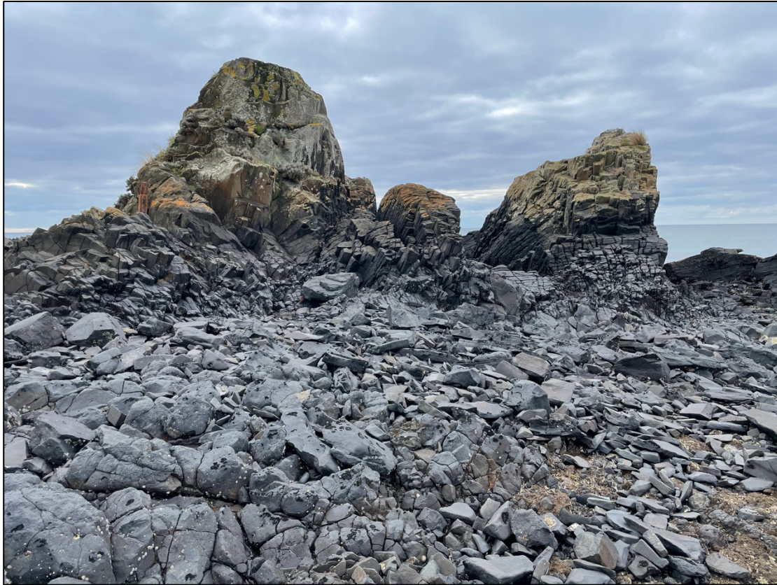
Mega-pillows just beyond the northern end of Godfreys Beach (along traverse ET).