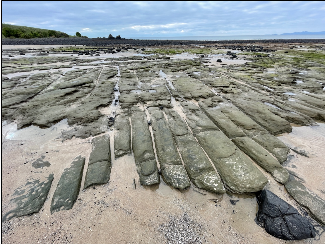
Volcanogenic sediment exposures at the north end of Godfreys Beach.