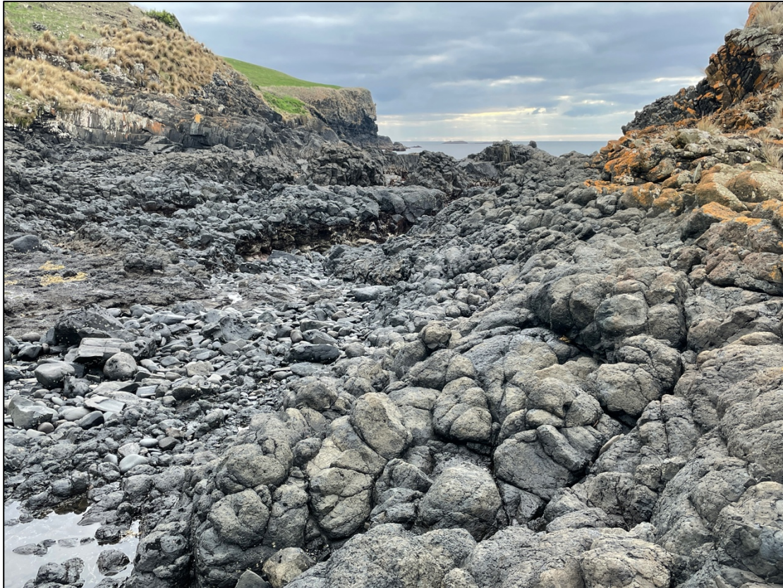
Multiple lava flow features; pillows, mega-pillows, sheet flows and lava lobes.