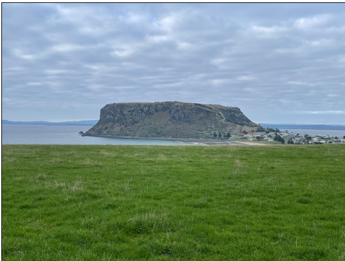
Unique geomorphology of The Nut with Stanley township visible on its western flank.