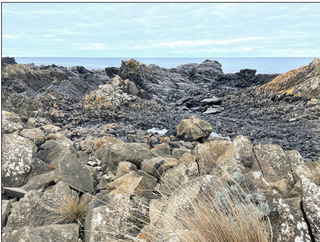
Complex lava flow cooling structures from sub-vertical to sub-horizontal in close juxtaposition.