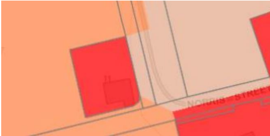
Figure 2: The adjoining land is currently to be zoned Rural under the draft LPS