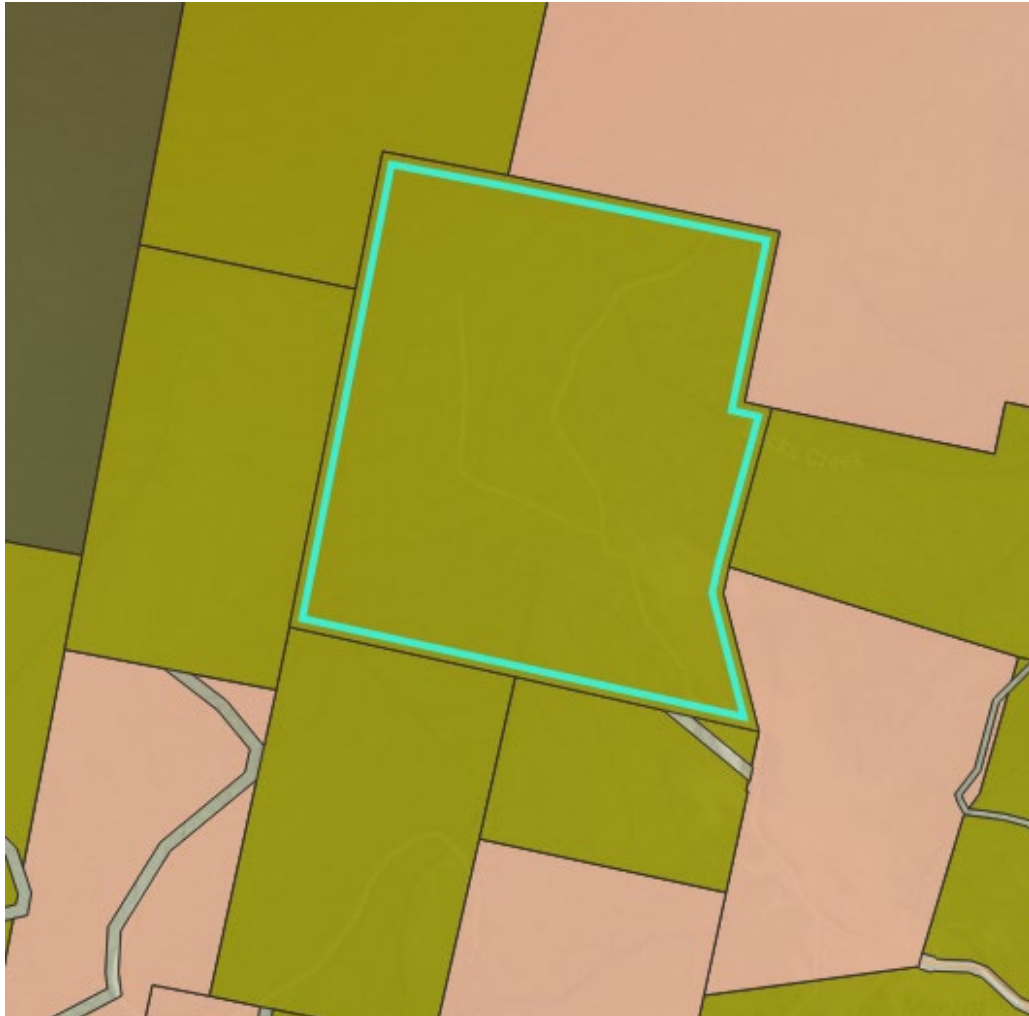
Location of title.