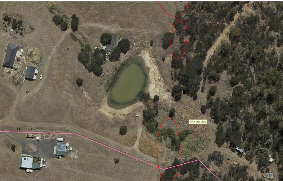
Figure 5 & 6: The location of the post and wire fence depicting the split zone boundary at 356 Baskerville Rd, Old Beach is clearly shown on ListMap within the red circles.