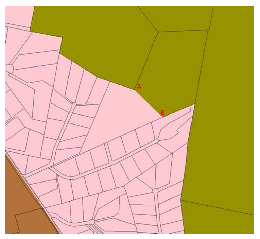
Figure 7: Recommended split zone boundary for 14 Tarquin Drive is between points A & B

The zone boundary is considered to satisfy the requirements of Practice Note 7.