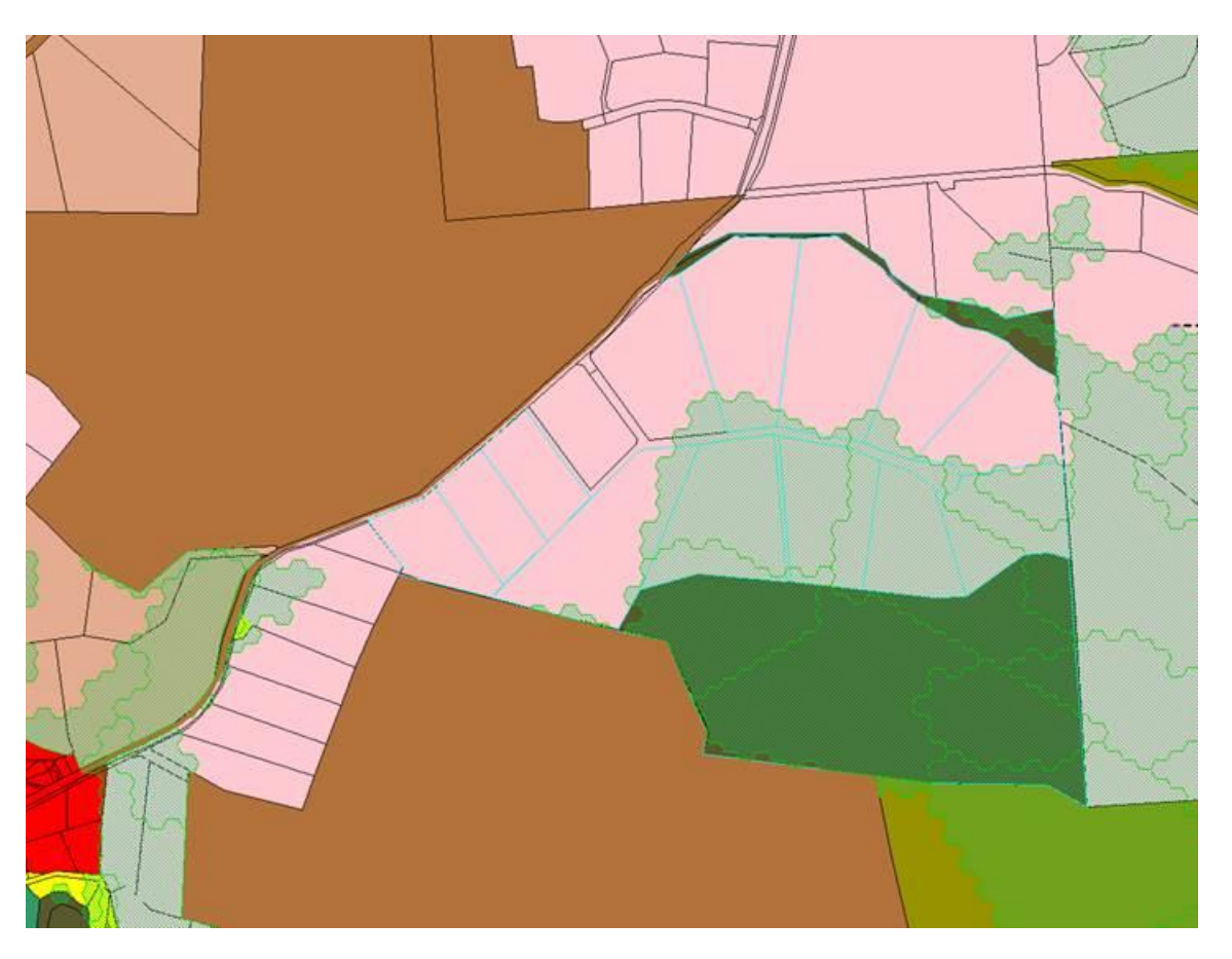
Figure 3: Application of the Priority Vegetation Area overlay to 110 & 166 Baskerville Road.

The Priority Vegetation Area overlay is recommended to be applied to the land as per the Regional Ecosystem Model (see Figure 3). The Priority Vegetation Area overlay will be introduced to 110 Baskerville Road and a small portion of 166 Baskerville Rd.