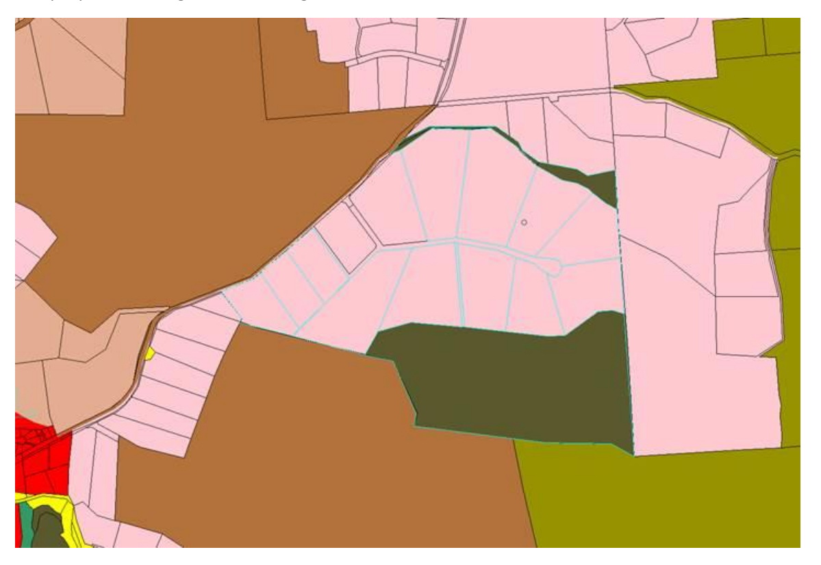
Figure 2: Recommended zoning of 110, 160 & 166 Baskerville Rd Old Beach. The pink area is Rural Living Zone (Area C) and the dark Green is Environmental Management Zone.

The proposed zoning is shown in Figure 2 below.