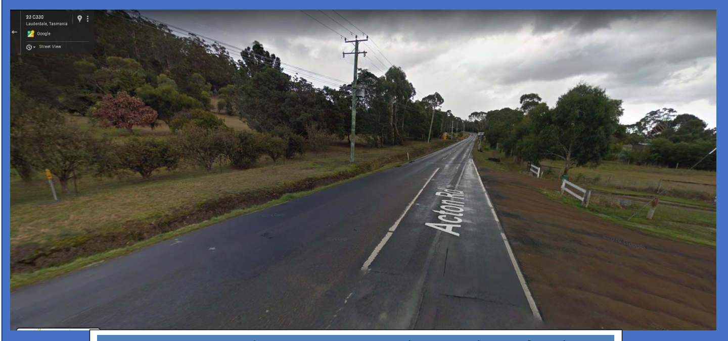
25 Acton Road, Acton Park. Right turn line of sight.