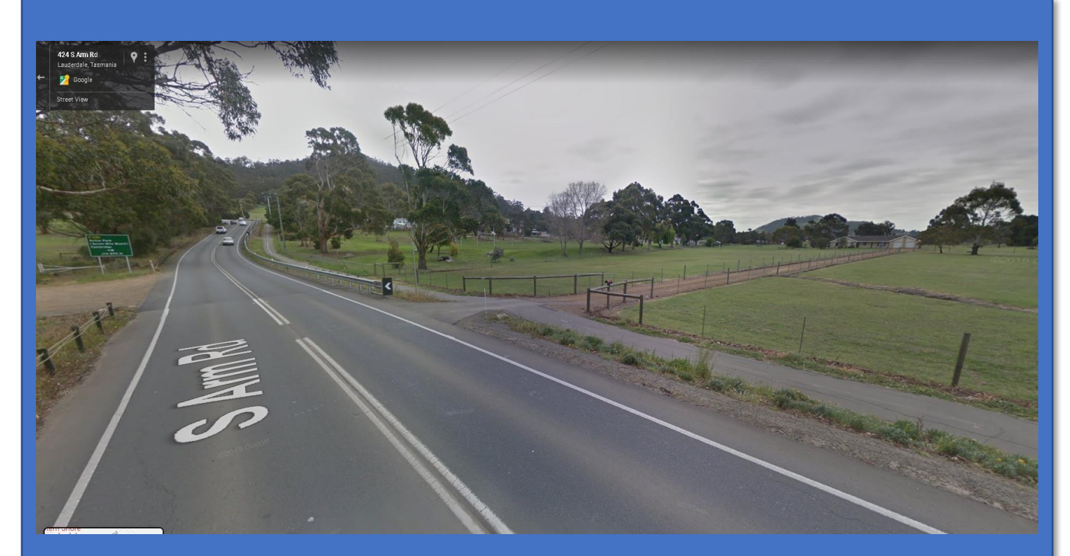
424 South Arm Road, Lauderdale. Right turn line of sight.