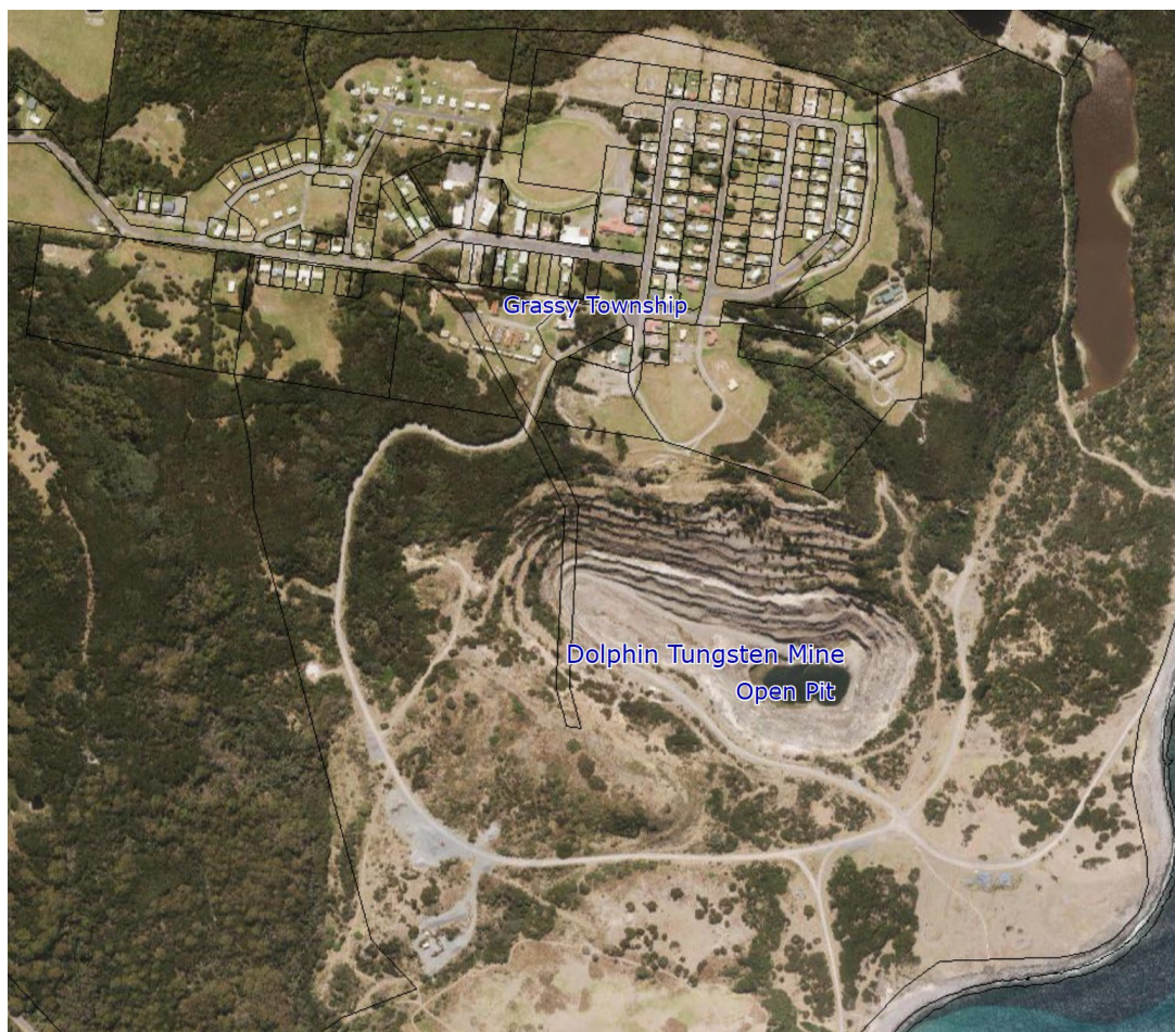
Image showing the location of the Dolphin Tungsten Mine in relation to the Grassy Township.

The mine was first established in 1917 and as it grew so did Grassy, the town built by the mine, complete with a swimming pool, tennis club, golf course and hundreds of houses. When the mine closed in the 1990's most buildings in the town were sold, resulting in the mine now having numerous near neighbours as can be seen in the following image.