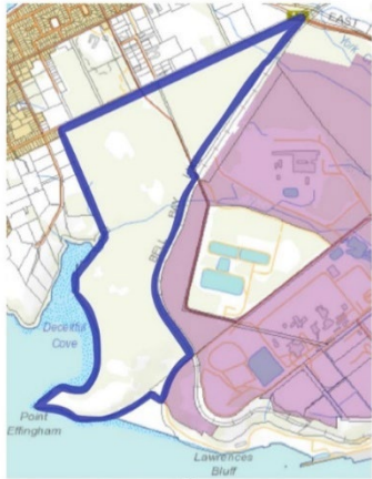
Area of interest : Title ref 154929/1