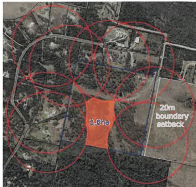
FIGURE 3: AREA OF UNCONSTRAINT AGRICULTURAL LAND

The subject site comprises about 16ha of useable land. Considering the existing and future residential developments adjoining the subject site an area of about 2.8ha would remain for unconstrained agricultural purposes applying a 200m setback from sensitive uses. The unconstrained agricultural area will be reduced even further with the development of the General residential zoned property to the north-east.