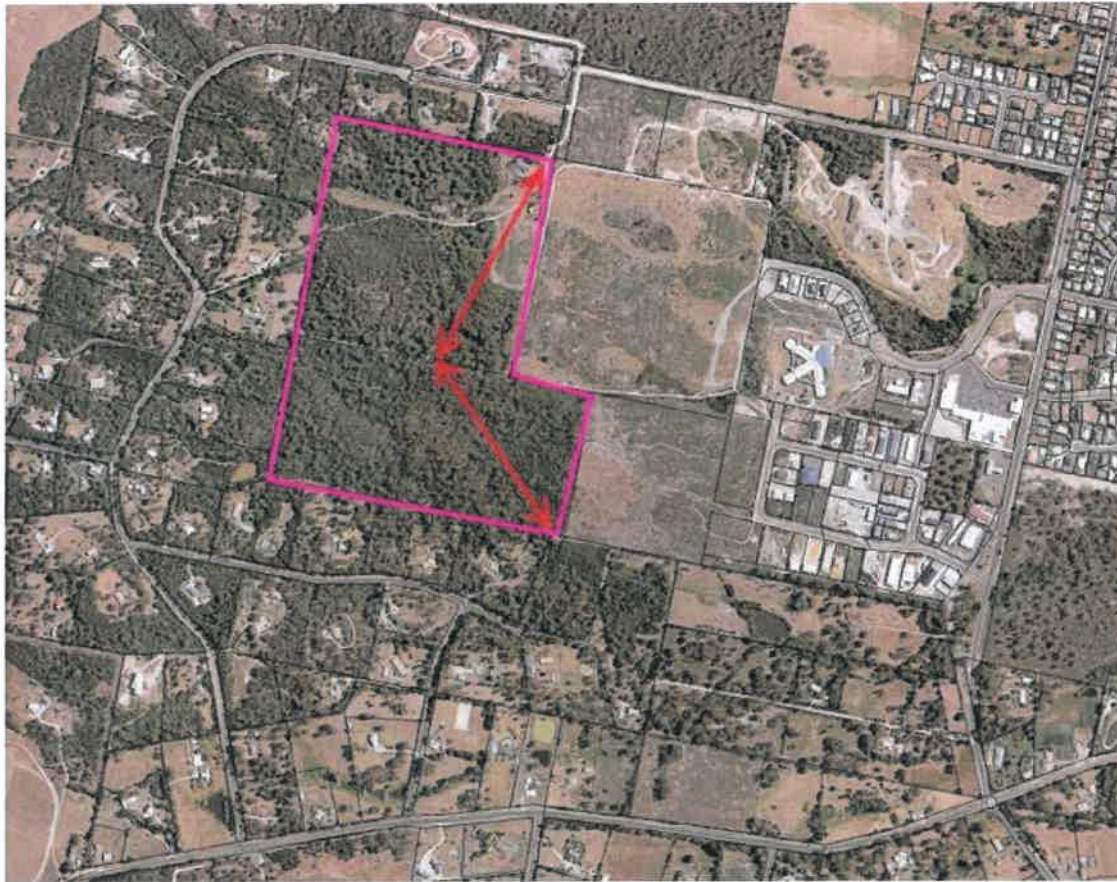
FIGURE 4: EXTRACT OUTCOMES REPORT OF PSSP REVIEW 2019 (P.76)

The above image outlines the future rural residential land west of the town centre (purple) as well as the indicative street links. The recommendations within the Outcomes Report of the PSSP Review state: