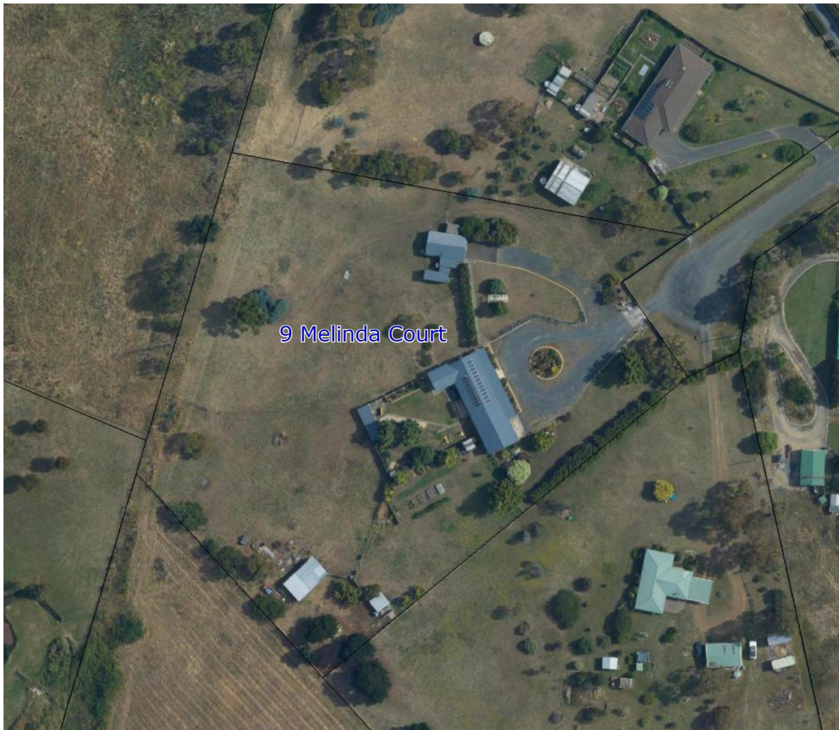
Figure 1: Property Location

There would appear to be two separate very different outcomes sought to be achieved via the SAP, those which relate to Precinct B (rezone land from Rural to General Residential with no Masterplan) and those which relate to Precinct A (rezone land from Rural Living to General Residential subject to a Masterplan). This difference is represented geographically in the two separate areas as shown figure 2 and Table 1.