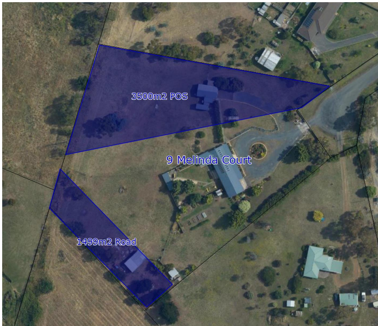
Figure 3: 9 Melinda Court showing the approximate areas which would need to be sacrificed to provide for the SAP.

My client strongly objects to the South Brighton Specific Area Plan (the SAP) as it is unworkable and ignores the fact that there are 36 individual property owners, all of whom have differing ideas, aspirations, financial capacities and family situations towards land development and what their land means to them. Implementation of the SAP requires cooperation between landowners, from a land development and financial perspective. In the three decades which I have worked in the development industry I have never encountered a situation whereby 36 individual landowners have all agreed and cooperated in delivering a masterplan, particularly one which does not have unanimous support