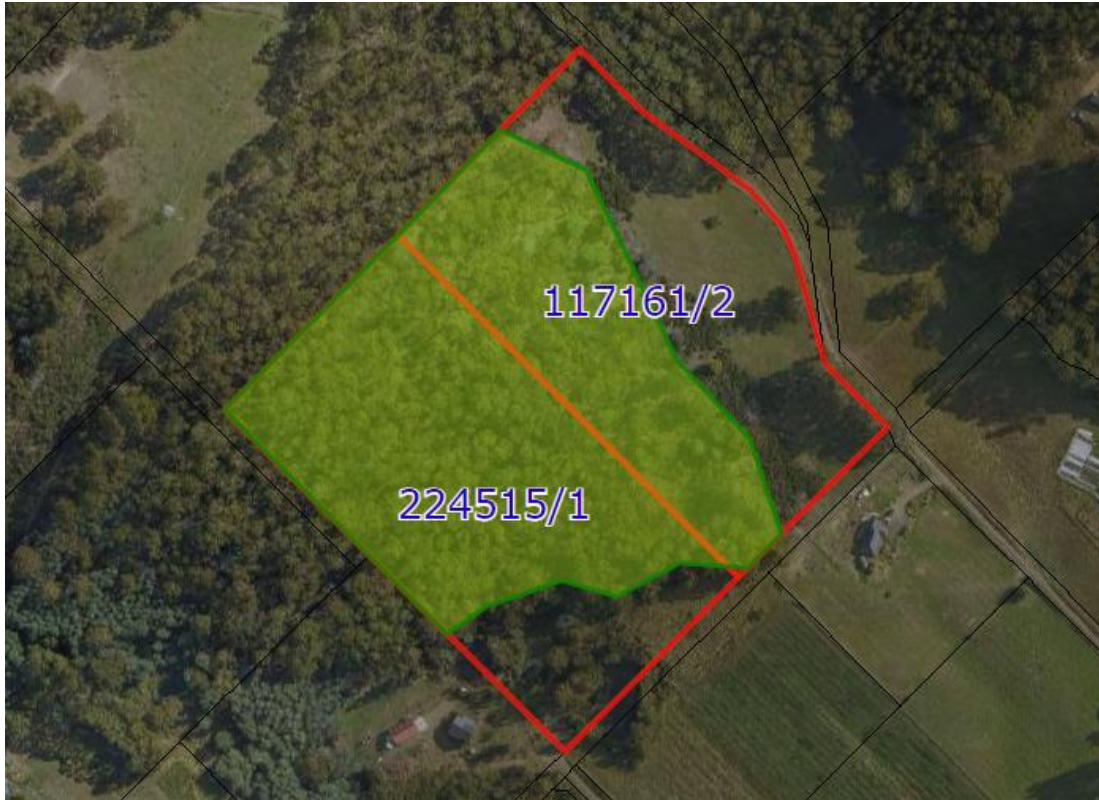
Figure 2 Suggested application of Priority Vegetation Area overlay (green hatching) to the affected titles.