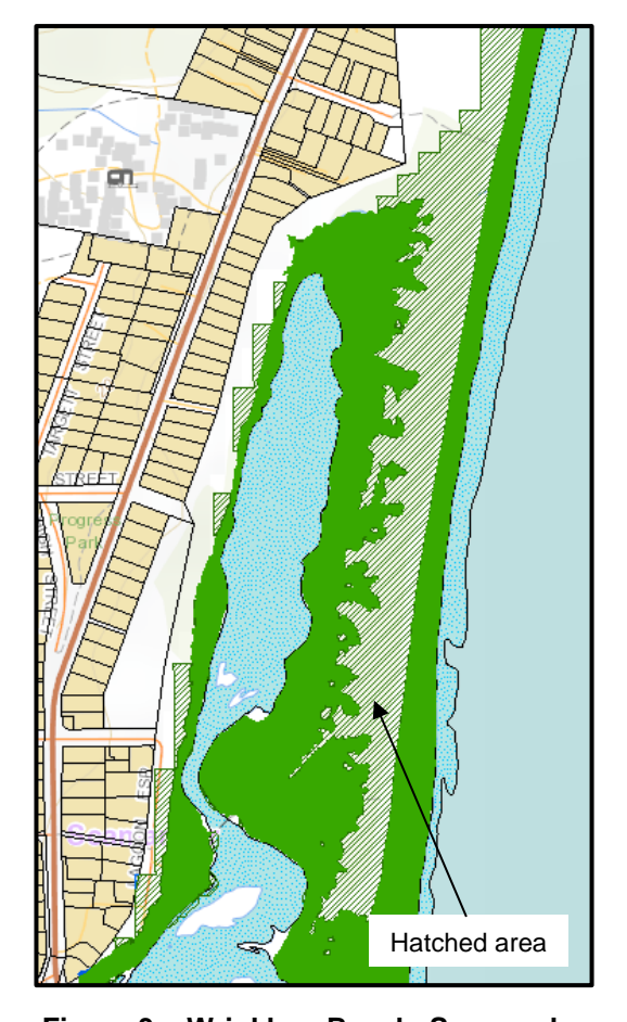
Figure 3 – Wrinklers Beach, Scamander