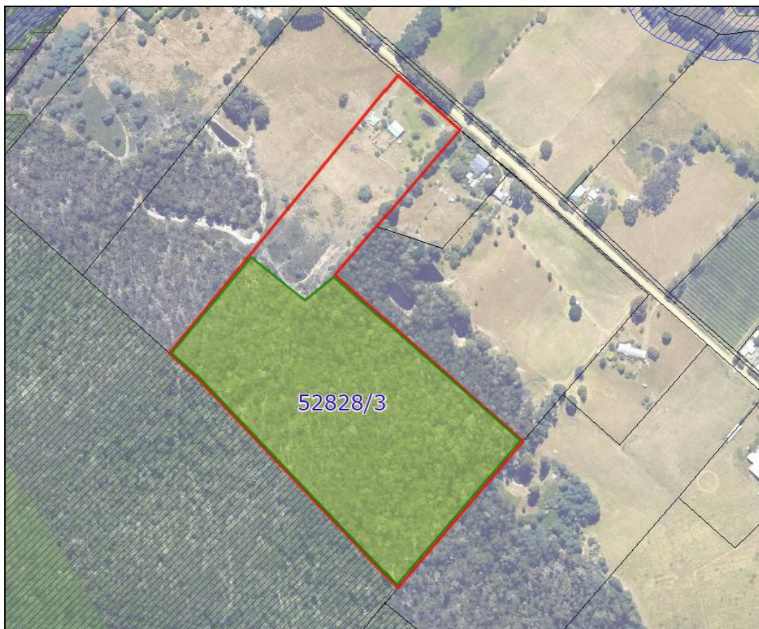
Figure 2. Suggested application of Priority Vegetation Area overlay (green hatching)