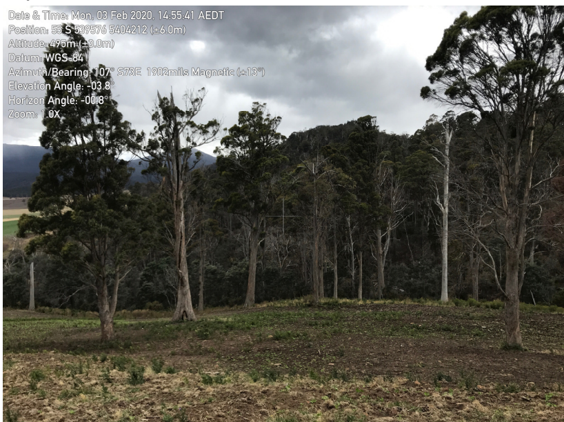
Figure 2. Some few eucalypts within the paddock area.

While there are few eucalypts remaining in the paddock area, and most are relatively young, it is always important to protect the one or two old trees with hollows, if at all possible, as they may provide nesting hollows for birds such as masked owl in future. However, this possibility is insufficient in the context of the pasture for this area to be retained as Priority Vegetation Area.