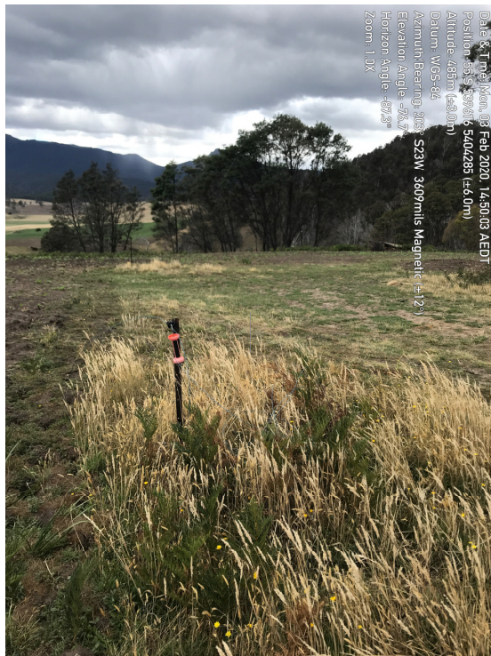
Figure 1. Remaining groundcovers show that they were a mix of pasture weeds like sweet vernal and fog grass, and some native patches of bracken, sagg, weeping grass and wallaby grass.

native understorey species that this would not now be classified as a native vegetation community. This area would now be classified under TASVEG as agricultural land (code FAG), with some remnant eucalypts and silver wattles. In recent years, the bulk of the vegetation has been gorse, until cleared by the landowners, and even the groundcovers below the gorse were mostly weedy grasses (e.g. Anthoxanthum odoratum , Holcus lanatus ) with just some patches of native species (e.g. Acacia dealbata , Pteridium esculentum , Microlaena stipoides – see Figure 1). In fact, TASVEG 3.0 and 4.0 classify much of this area as “weed infestation” (FWU). While some of the area was classified as “lowland grassland complex” (GCL), this too was degraded by weeds and is now converted to pasture.