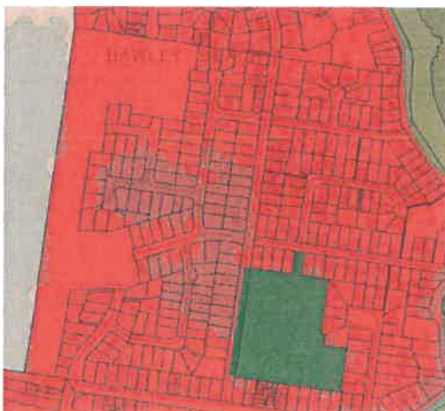
Figure 3: Priority Vegetation Mapping (Pitney Bowes)

woodland on dolerite. The vegetation was removed as part of Forest Practices Plan RBM046.