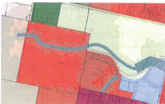
Figure 2: Club Drive Land

The modification would be to apply the priority vegetation area overlay consistent with Guideline No. 1.